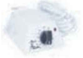
IN2073 - "mini-phaser" iron controller $29.95

Features solid state circuitry. Precise current adjustment with on/off LED indicator. Measures: 3-3/4 x 4-1/2"