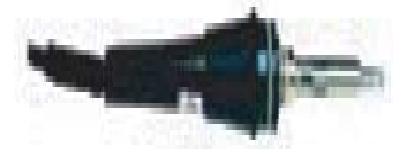
IN2317 - insta-heat soldering iron $52.95

The Insta-Heat Ceramic Soldering Iron heats in 45 seconds. The element is expected to last twice as long as conventional soldering iron elements.