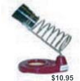
IN2074 - soldering iron stand $10.95

Features a heavy cast iron base and coiled spring steel socket for soldering iron. Includes a well for a wiping sponge in the base.