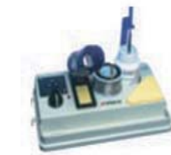
IN21091 - inland solder station $35.00

Holds all soldering tools and equipment in one place ready to use. Features include: - High-impact plastic, impervious to hot solder drips. - Built-in temperature controller