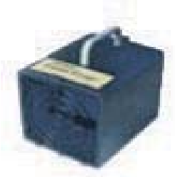
IN21081 - inland fume trap $49.95 IN21081FT - 3pc. fumetrap replacement filters $14.95

Self-contained fume absorber gets rid of vapors created while soldering. Small, light and easy to move around the bench top. Utilizes a two-stage filter. The activated charcoal portion absorbs gases such as hydrogen chloride and carbon dioxide. The small micron section accumulates evacuated lead vapors, keeping them away from the person who is soldering. Draws fumes from 12-14" away from unit. Made of stamped steel—grey fleck body with grey handle. 115 volt axial motor. One year warranty. Weighs 3 lbs., 9 oz. Measures: 5" x 5" x 6"