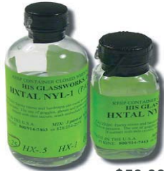
HXTAL NYL-1 - hxtal nyl-1 epoxy adhesive $50.00

AN ULTRA PURE RESIN THAT STAYS PERFECTLY WATER WHITE