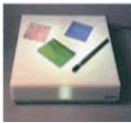
7258 - portable light box